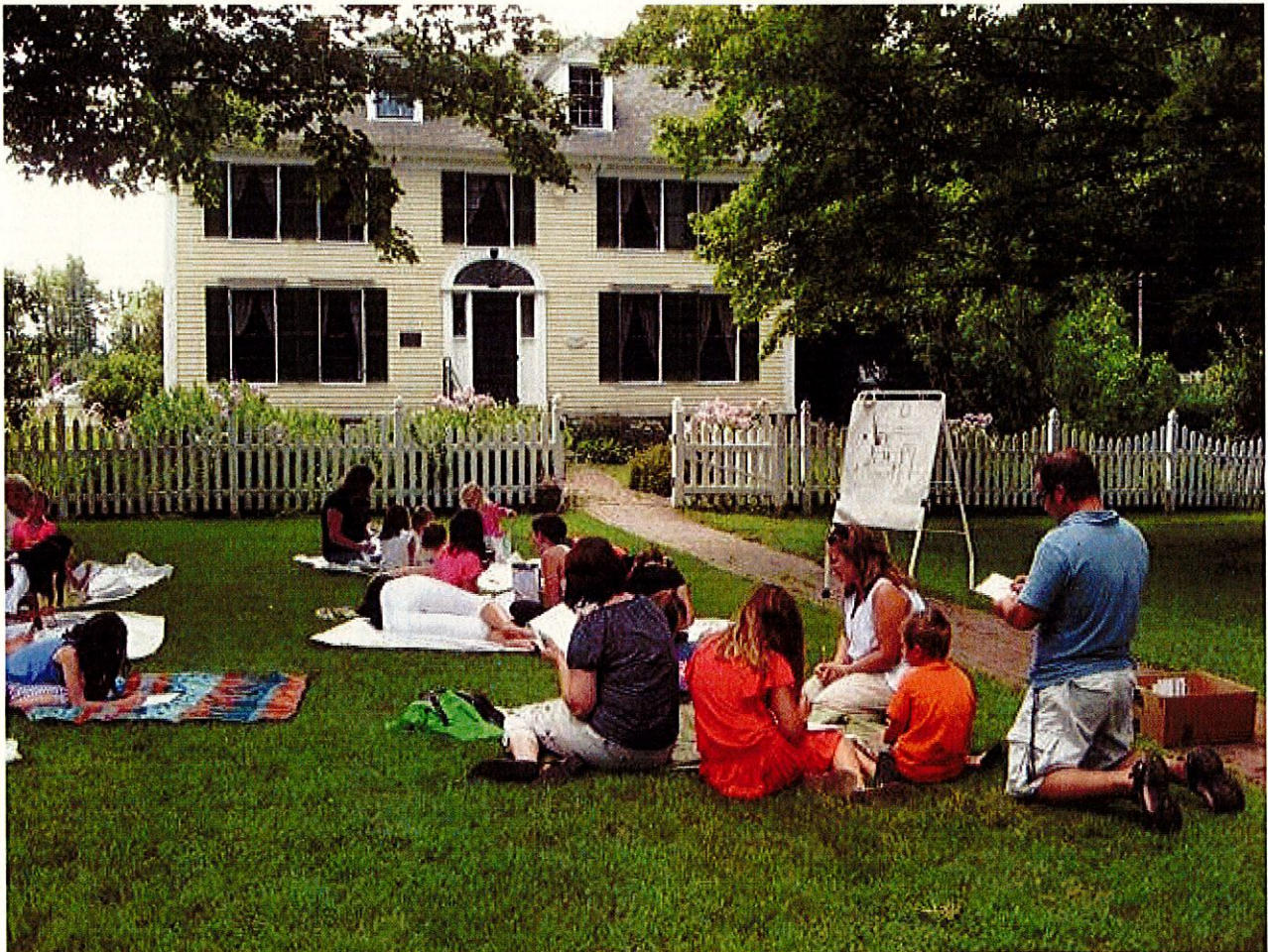
Baxter Museum and Grounds Baxter Memorial Library's "Painting in the Park Series"