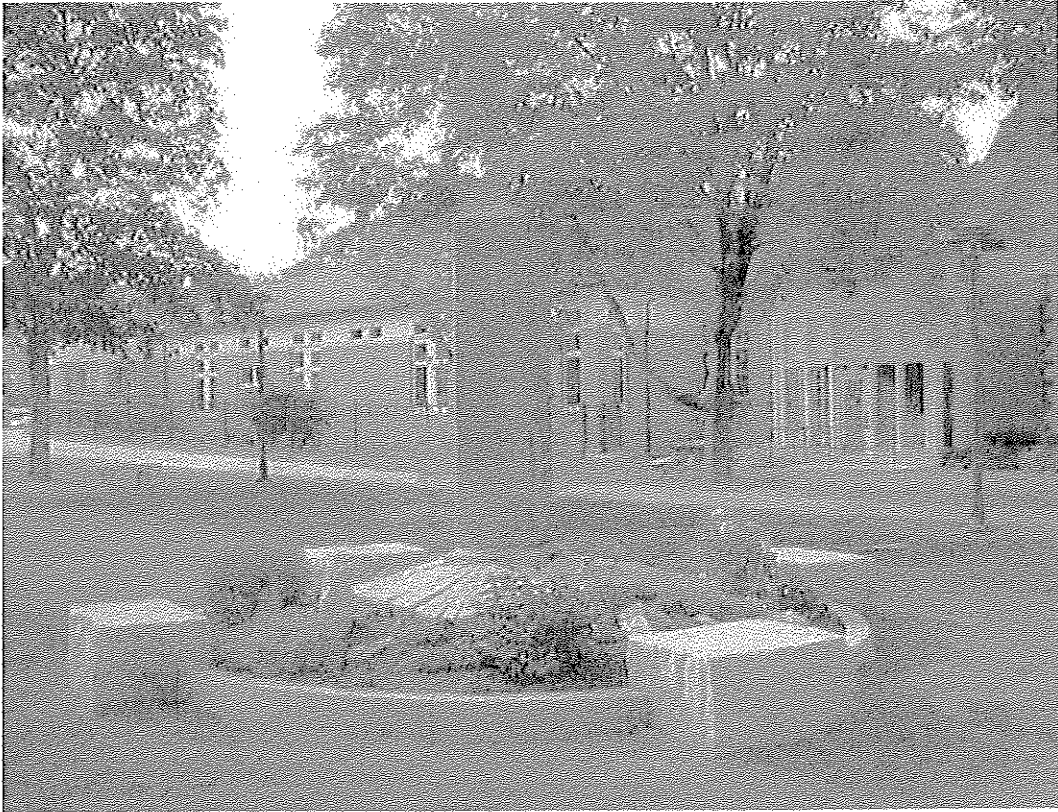
Gorham Founders Monument