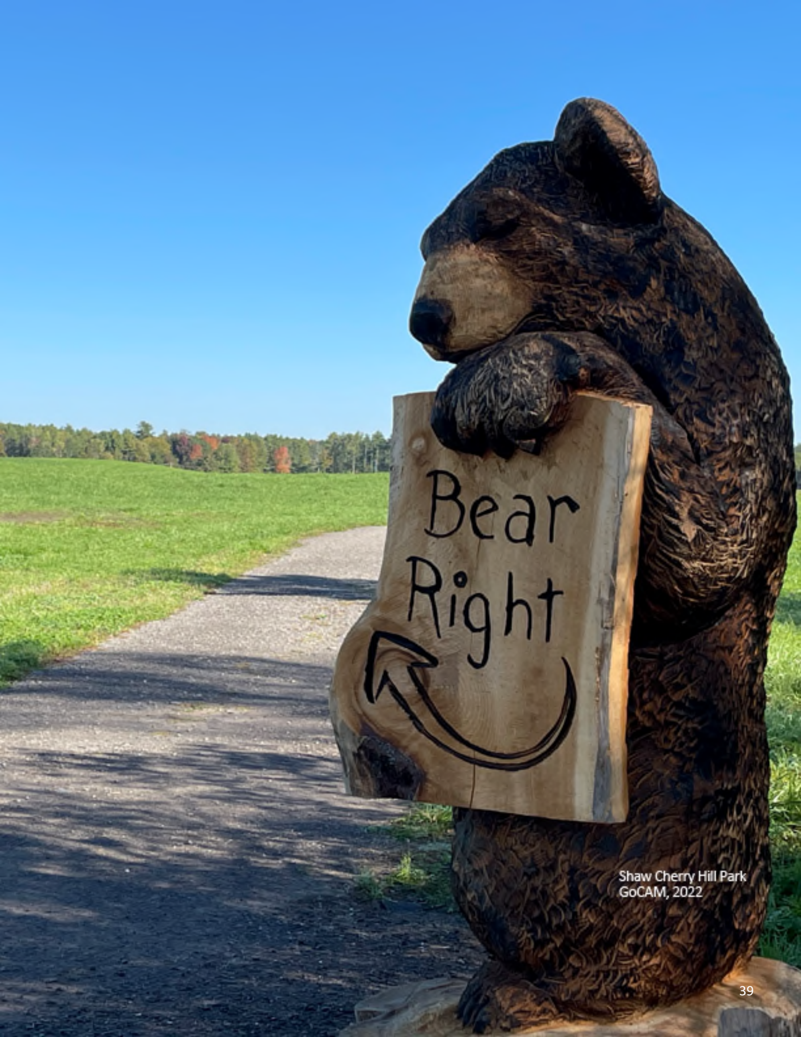
Shaw Cherry Hill Park GoCAM, 2022