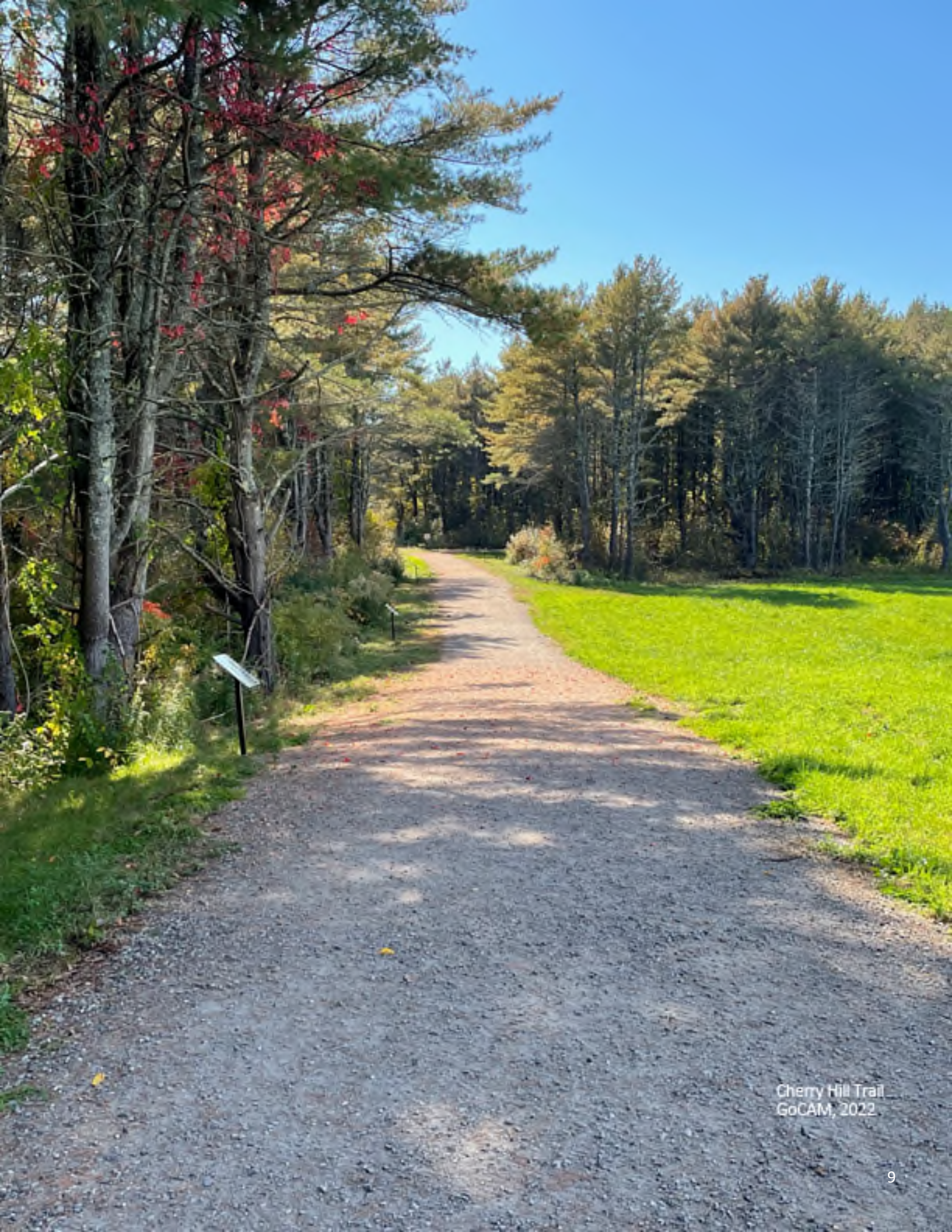
Cherry Hill Trail GoCAM, 2022