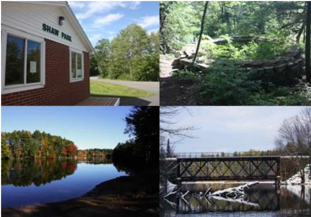
Shaw Park through the Seasons