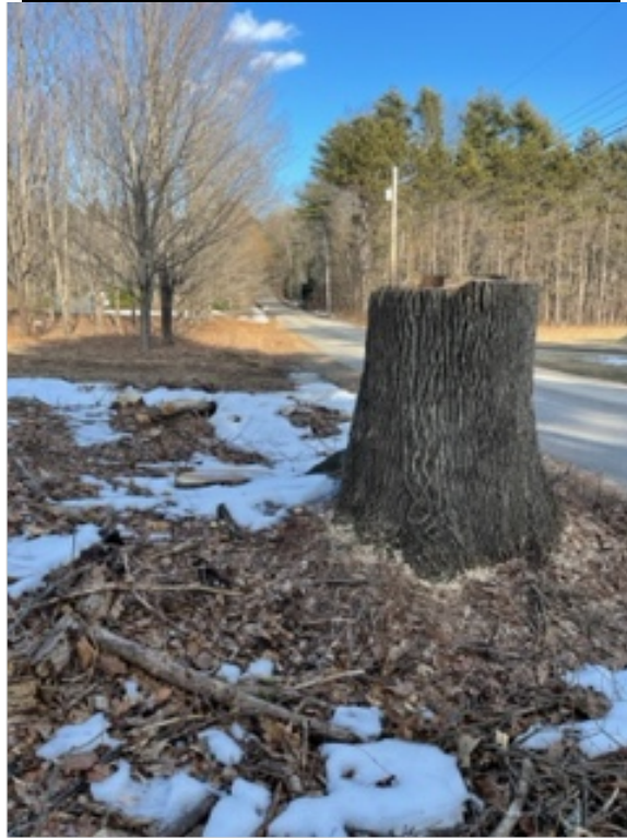
Looking Left from Approximate Sight Entrance