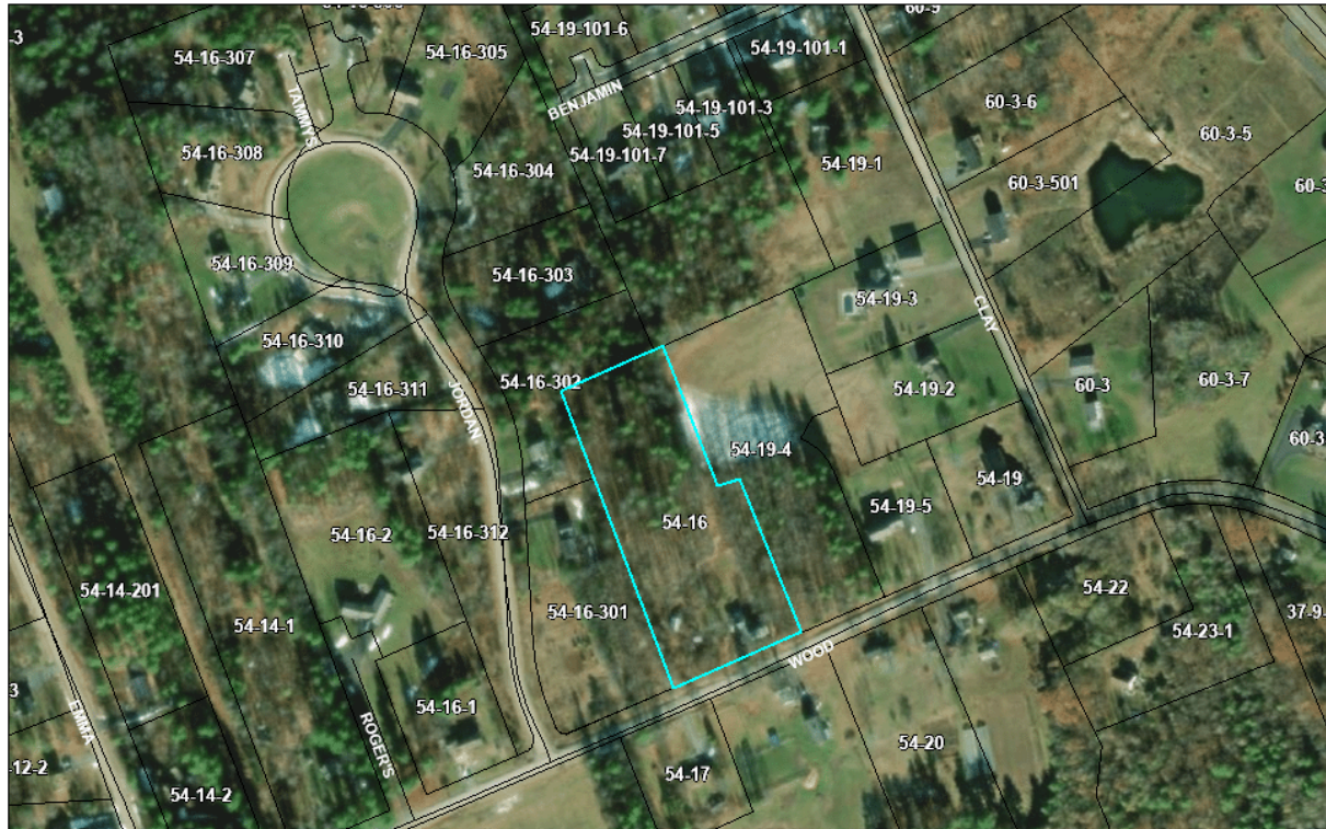
Town of Gorham Public Map Viewer