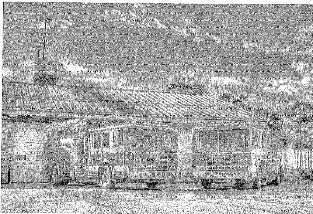
Gorham Fire Department's Engine 6 and 2