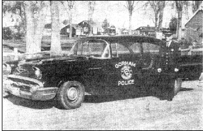
Gorham's first Police cruiser