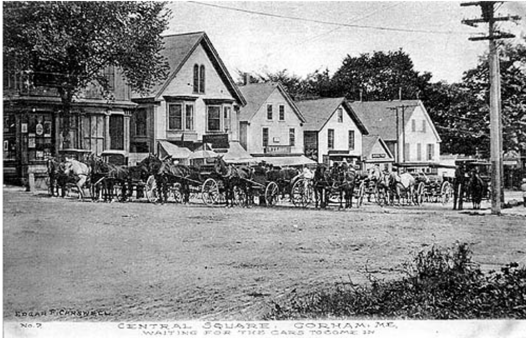
Central Square – “Waiting for the cars to come in”